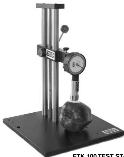
FTK 100 TEST STAND

The Wagner Fruit Test™ FTK 100 Test Stand provides added control of fruit testing resulting in greater accuracy through repeatability.